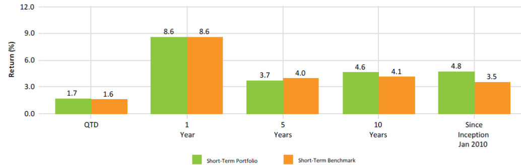
Multi-Period Performance Analysis