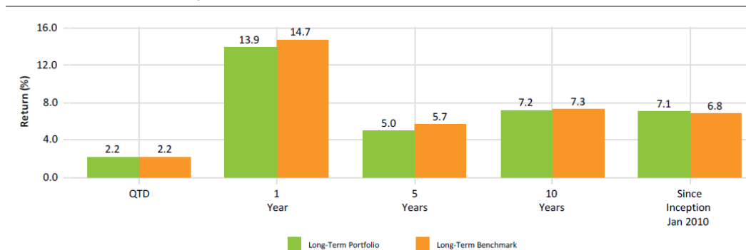
Multi-Period Performance Analysis